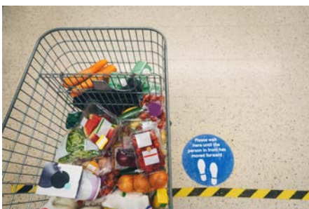
Signage to promote social distancing measures